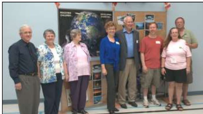
BCM Missionaries/Camp Directors serving at Mill Stream/Crusaders from 1975 to present

When the rain finally stopped it allowed many guests to explore the camp and see what changes and improvements have been completed over the years. It also provided good weather for the children to utilize several of the activities available and attend an outdoor campfire hosted by our staff.