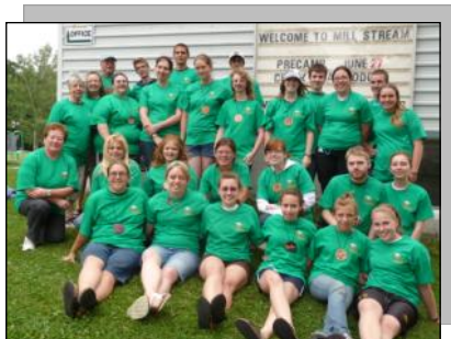
Our 2009 Staff Team

Staff: We are still in need of cabin leaders and assistant cabin leaders. If you are 16 years or older and feel called to be part of the summer staff at Mill Stream, please visit our website at www.MillStream.ws/opportunities.html for details and forms.